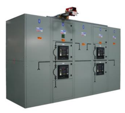
draw out circuit breakers with mimic bus and lifter

Switchboards for Industrial Applications are available with a wide variety of configurations. Can be constructed with individually mounted power circuit breakers or fused bolted pressure switches. Compartmentalization of bus available for increased safety.