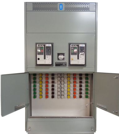
switchboard with cam-lock connectors