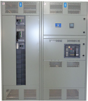
circuit breaker switchboard

All brands of fuses and circuit breakers are available to be installed in AMP's distribution switchboards.