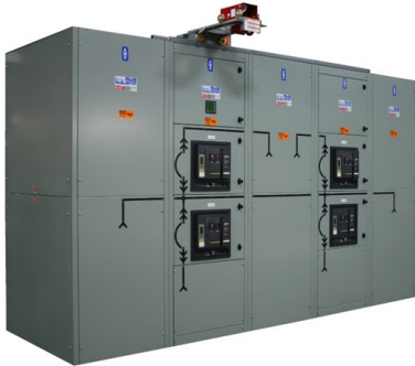
draw out circuit breakers with mimic bus and lifter

Switchboards for Industrial Applications are available with a wide variety of configurations. Can be constructed with individually mounted power circuit breakers or fused bolted pressure switches. Compartmentalization of bus available for increased safety.