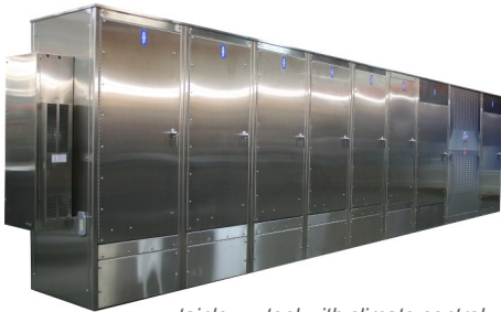
stainless steel with climate controls